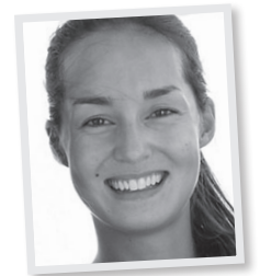
Photo: Please attach a smiling and friendly photo (no child wants a sad looking au pair). If you have a body piercing, you should consider removing it for the photo and keep it out during your stay in the USA as most host families will not want a pierced au pair. This photo is your host family's first impression. Make it a positive one.